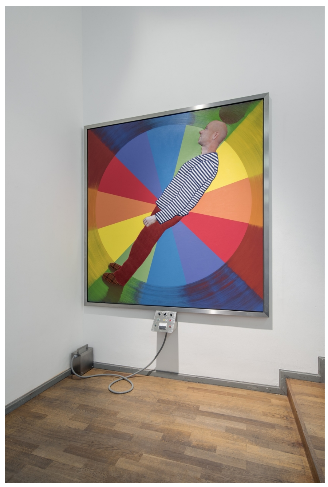
Kaido Ole, The Drum of Choices. Oil, acrylics and a textile appliqués on the canvas, stainless steel frame with remote control, 187 × 197 cm, 2016.