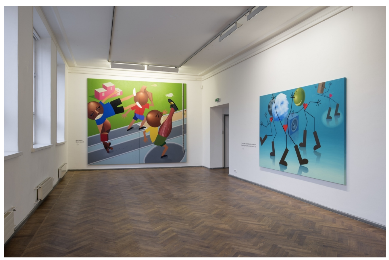
Kaido Ole, Nogank Hoparniis, exhibition view, Tallinn Art Hall, 2016.