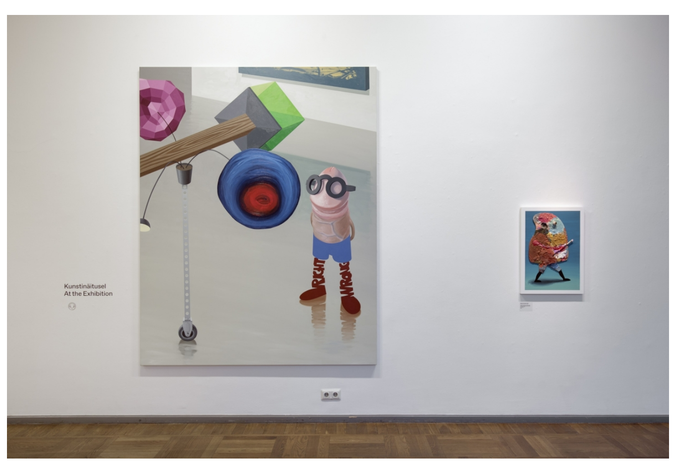
Kaido Ole, Nogank Hoparniis, exhibition view, Tallinn Art Hall, 2016.