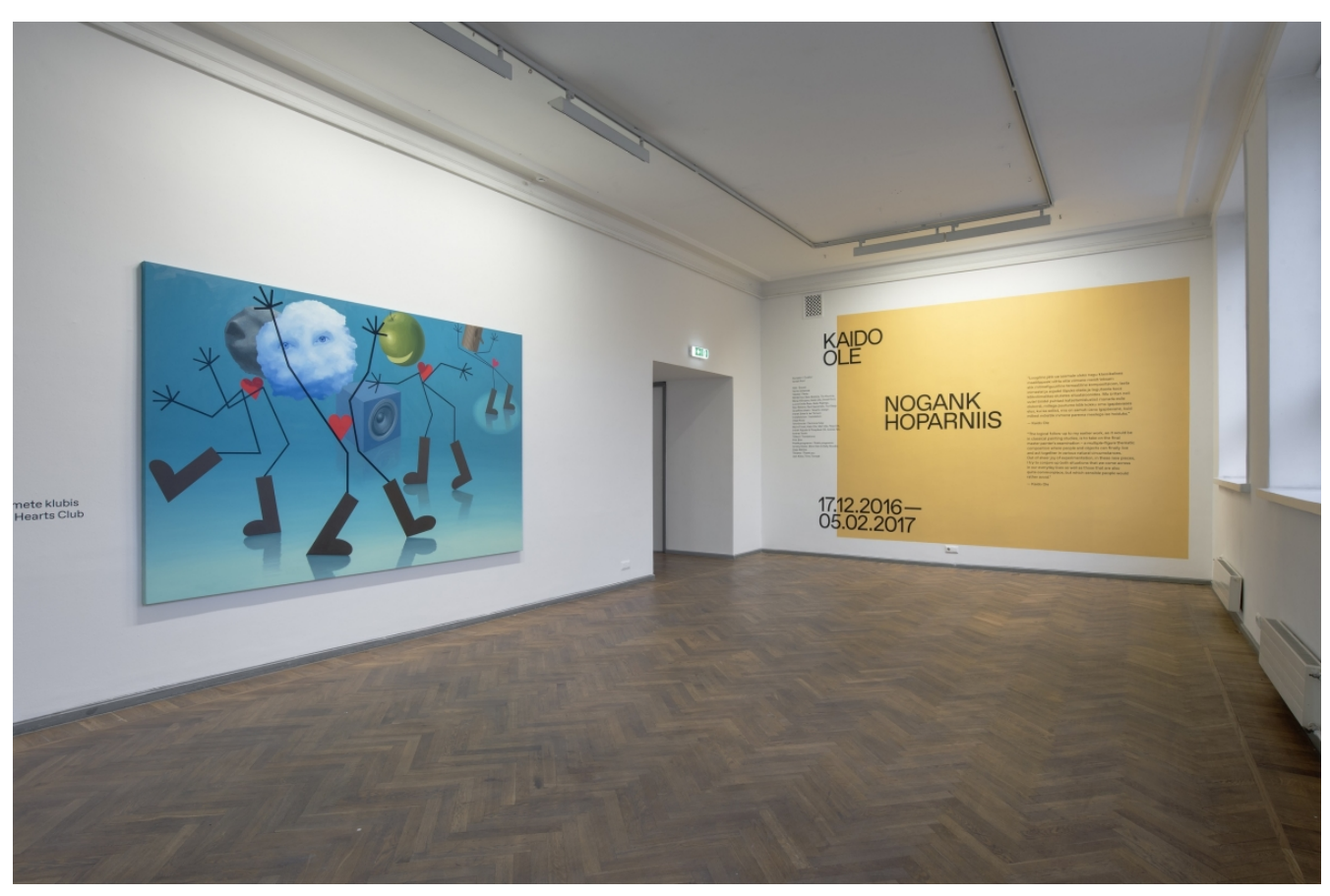
Kaido Ole, Nogank Hoparniis, exhibition view, Tallinn Art Hall, 2016.