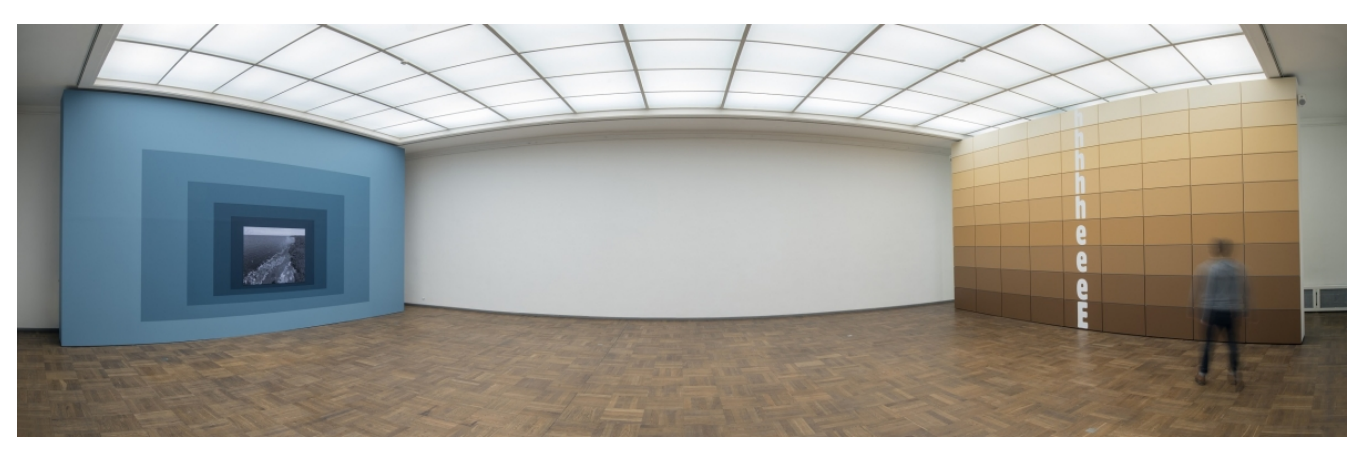
Panorama of The Origin of Estonia and The End of Estonia, Tallinn Art Hall, 2016