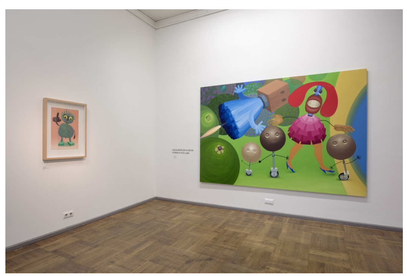
Kaido Ole, Nogank Hoparniis, exhibition view, Tallinn Art Hall, 2016.