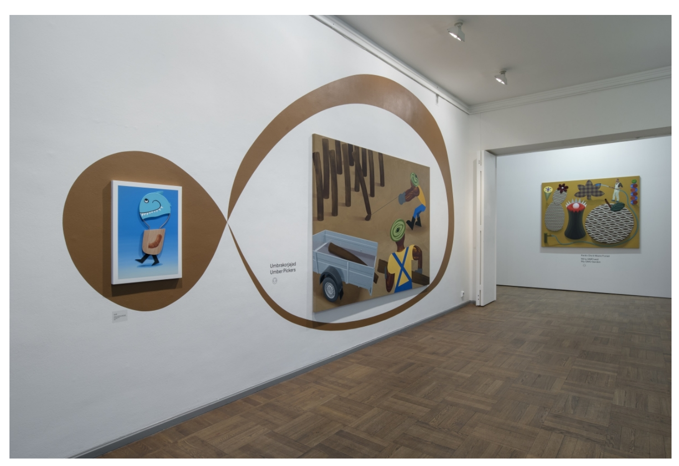
Kaido Ole, Nogank Hoparniis, exhibition view, Tallinn Art Hall, 2016.