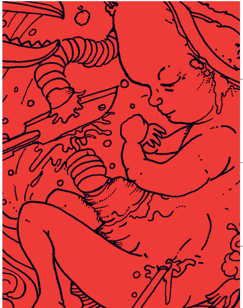
LIINA PÄÄSUKE Liina Pääsuke at the exhibition „DOings&kNOTs“ (2015)