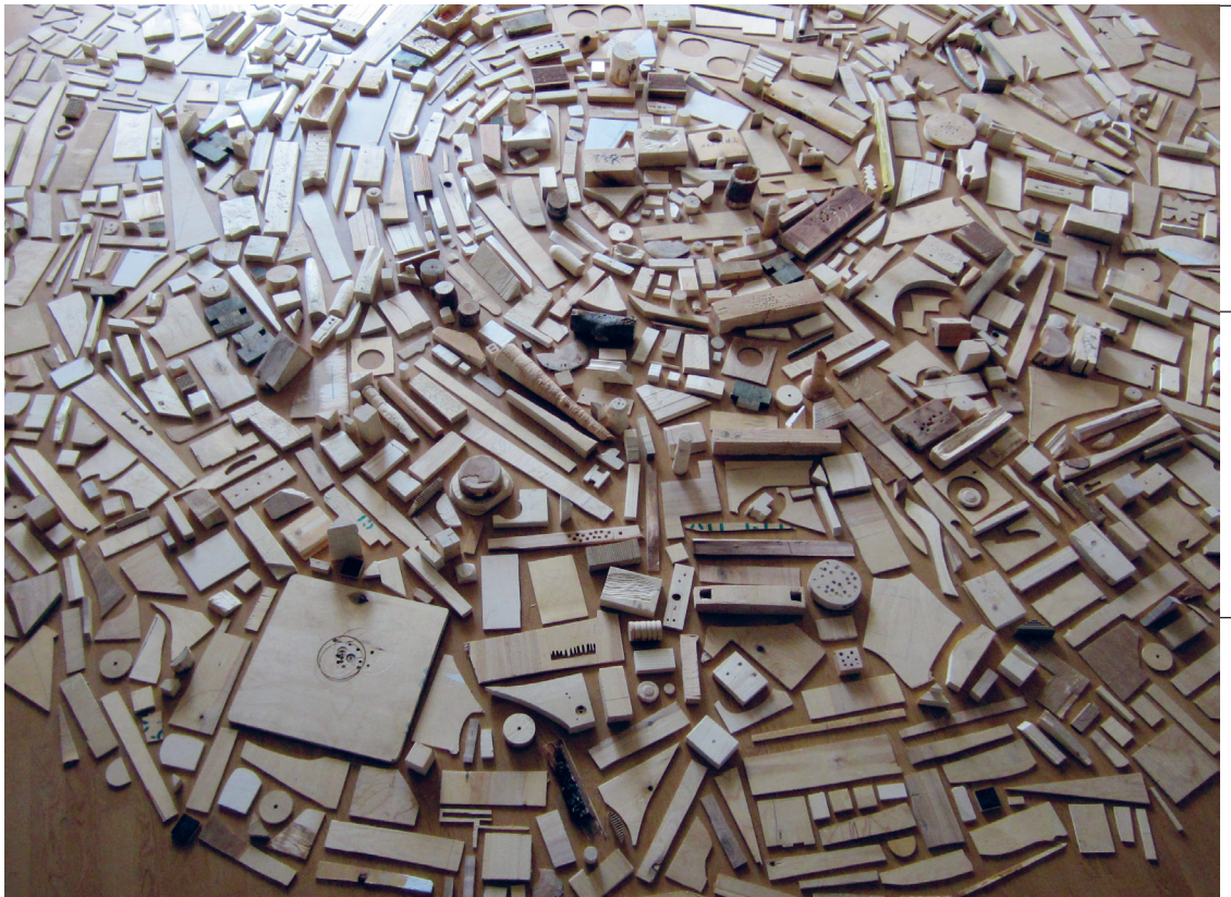
ELEONORE DE MONTESQUIOU Still from the film „Le General“ (2017)