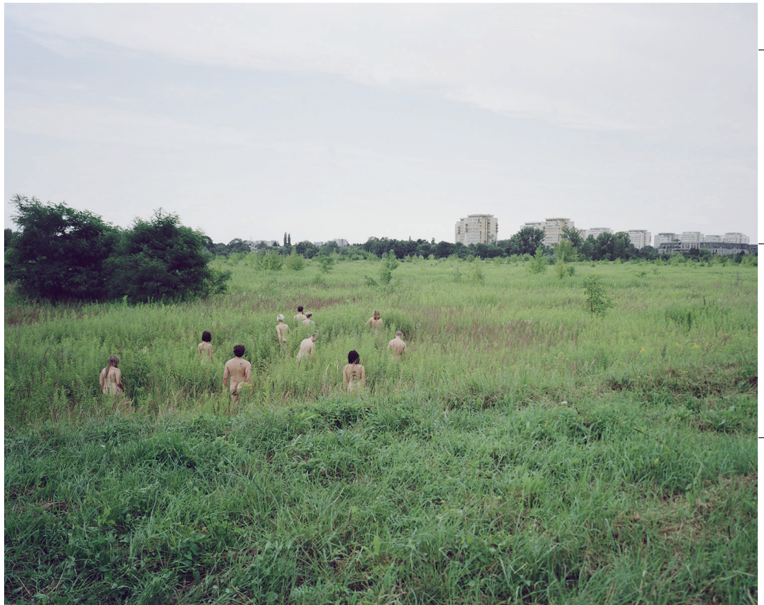
THE IDIOTS Still from the video "The Hazard of Being Good" (2019)